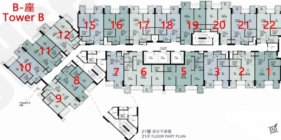
21樓 部分平面圖 21/F FLOOR PART PLAN