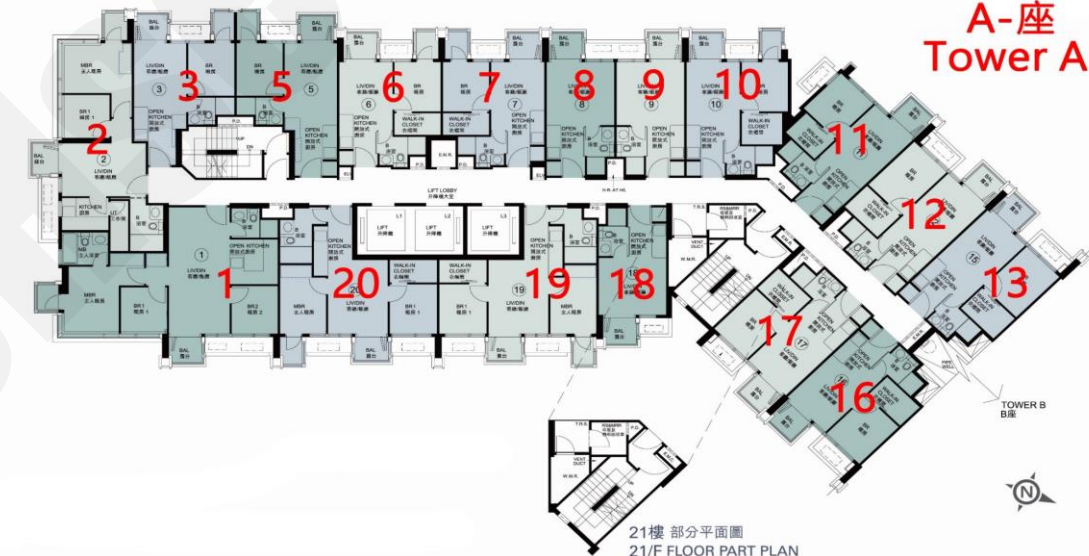
21樓 部分平面圖 21/F FLOOR PART PLAN